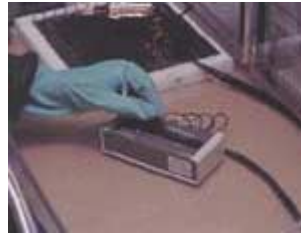
Trimming RH Sensor