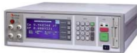
Figure 2: 7000 Series Precision LCR Meter

The 7600 Precision LCR Meter shown in Figure 1 and Figure 2 can measure and display any 2 of 14 impedance parameters simultaneously. Up to six different tests, each with its own conditions and limits can be run in sequence with a single push of the start button.