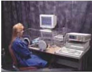
Initial C Measurement